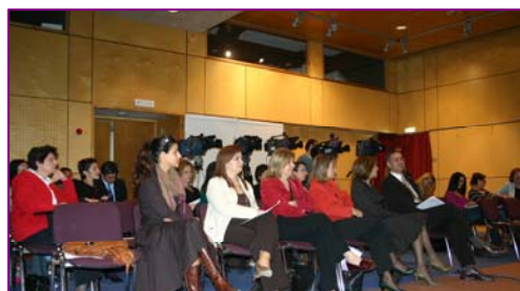
Around 20 people attended the press conference, including journalists, public officials and NGO's.

Within the framework of this project MIGS also organised a press conference for the presentation of the results of the Cyprus Research Report. The press conference received a lot of media coverage and was opened by Dr. Costas Kadis, Minister of Health and attended by government officials, journalists and NGO's.