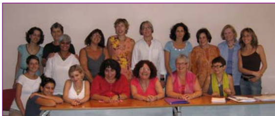
Participants from the workshop group together for a picture

MIGS conducted the ESF Exploratory Workshop entitled “Feminisms and Activism: Transversal Politics in Contemporary Europe and across the Globe” on the 12-16 September 2007 in Nicosia, Cyprus.