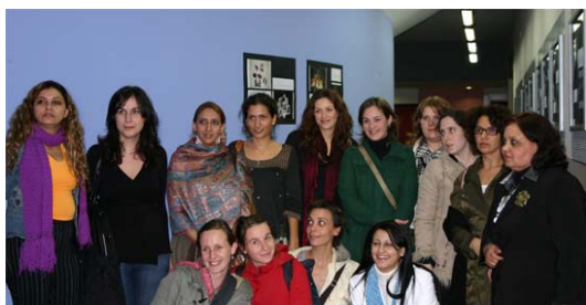
Participants from the workshop pose for a group photo during the photo exhibition

MIGS is coordinating a project entitled "Intercultural Dialogue on Violence against Women", funded by the Anna Lindh Euro-Mediterranean Foundation for the Dialogue between Cultures .