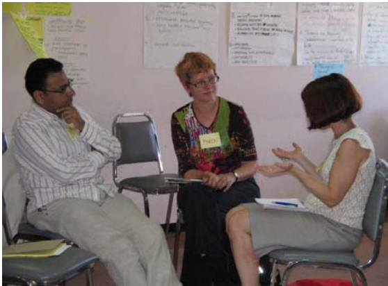
Partners to the project "Preventing violence against girls and women in patriarchal families" working in groups at the Cyprus meeting in June 2005

MIGS is proud to announce that it has recently assumed the secretariat of Women's International Studies Europe (WISE) , a European association for individuals and institutions involved in women's studies, founded in 1990. Everyone interested and involved in women's studies and gender research can become a member of WISE. Members receive our regular newsletter, WISE Women's News, as well as new special publications. Full membership also includes a subscription to the European Journal of Women's Studies. For more information on becoming a member of WISE please visit the website at www.wise.medinstgenderstudies.org .