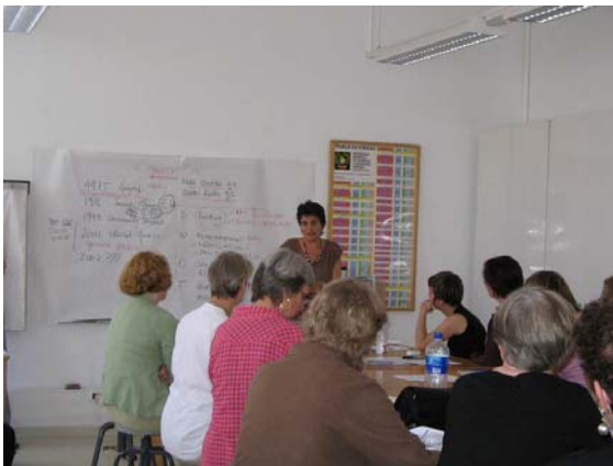
The ATHENA workgroup 3b "Equal Opportunities, Rethinking Policy Aims, Instruments"

ATHENA is happy to announce the publication of Volume VI in the series " The Making of European Women's Studies ", a joint publication with the Universiteit Utrecht. The volume includes reports, news from the AOIFE secretariat, a position paper by one of ATHENA's leading experts, case studies, and country reports from Denmark and Finland.