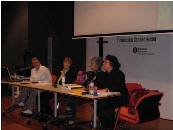
The Utrecht Coordination team at the ATHENA plenary meeting in Barcelona